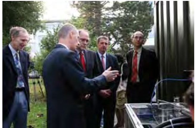
Figure 4: Presentation of the mobile-dwelling cogeneration unit to the Slovenian Minister for Development and European Affairs, Mitja Gaspari M. Sc.; at the JSI, October 2009

Our department members taking part in the project entitled “Development of demonstration prototype of mobile cogeneration fuel cell based system for military purposes” were given an award by the Ministry of Defense of the Republic of Slovenia and the Slovenian Technology Agency for a very successful project implementation.