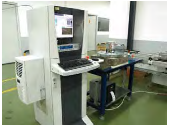
Figure 5: Diagnostic system for electronically commutated motors.