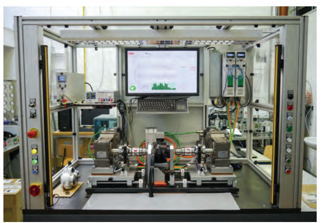
Figure 4: Diagnostic system for End-of-line control of electric drives for bicycles of the Pedelec type (Pedal Electric Cycle)

For the Domel Company, Železniki, Slovenia, we designed and built a semi-automatic diagnostic system for the end-of-line control of electric drives for bicycles of the Pedelec type (Figure 4). The mechanical part of the machine consists of two electrically driven helical bevel gear units for simulation of the driving torque and load, and of a manipulator to hold the unit under test during the operation. The diagnostic procedure consists of electrical tests of the control and communication loops, calibration of the internal sensors, encrypted programming of parameters, short run-in, test of torque assistance at several levels and speeds, free-run test, braking operation and safety functions. Also, vibrational tests are made in the range