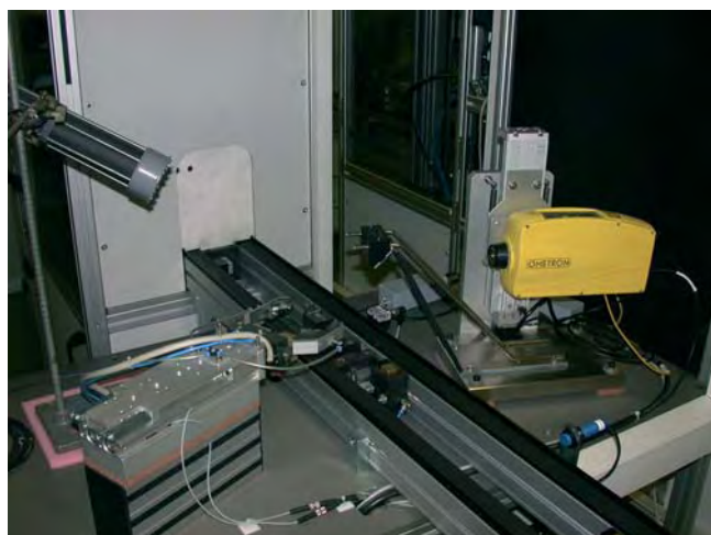
Figure 2: Laser based measurements of vibration of suction units in the quality control cell.

control algorithms in programmable logic controller (ASPECT) has been continued. The emphasis was given to the transfer of the developed SW to new HW and SW platforms, respectively.